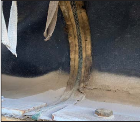
After many years of service, some operators have experienced the OEM zipper replacement design is difficult to open and close, and poorly seals the inlet duct