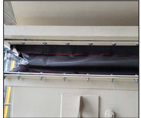
A new composite fabric expansion joint is installed with PTFE flange gaskets, new hardware assemblies, and the previously removed backing bars

Choose BADGER for your COMPLETE TURNKEY repairs. Lower future maintenance costs of your air inlet expansion joint.