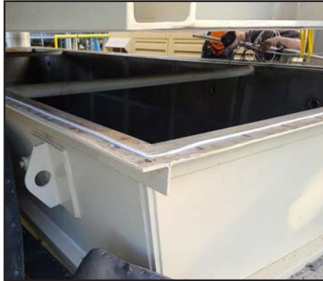
Badger's turnkey replacement service includes removing the existing fabric expansion joint, hardware assemblies, and backing bars