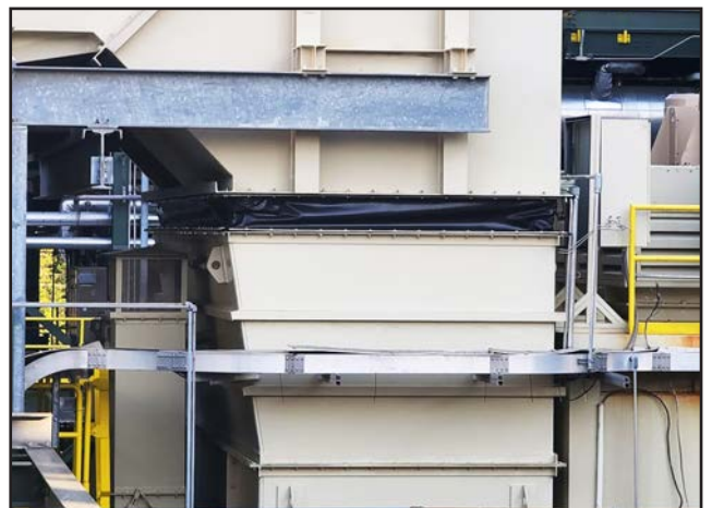
Badger's air inlet duct expansion joints eliminate the costly OEM zipper closure