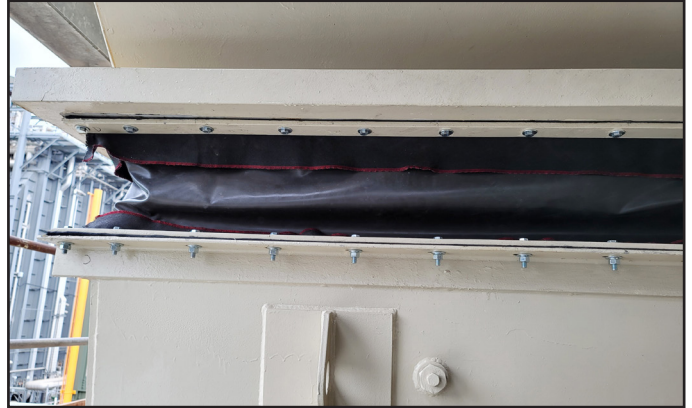
A new composite fabric expansion joint is installed with PTFE flange gaskets, new hardware assemblies, and the previously removed backing bars

Choose BADGER for your COMPLETE TURNKEY repairs. Lower future maintenance costs of your air inlet expansion joint.