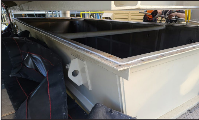
Badger's turnkey replacement service includes removal of the existing fabric expansion joint, hardware assemblies, and backing bars