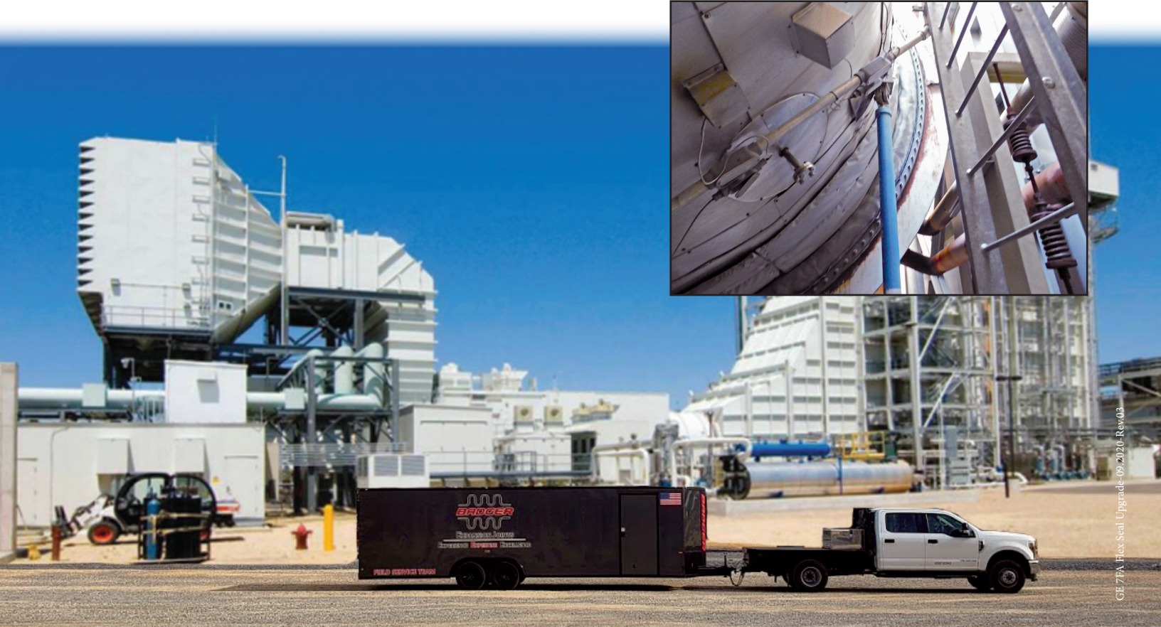
GE 7FA Flex Seal Upgrade-09-2020-Rev03

Contact Badger today to discuss which option is best for your 7FA turbine.